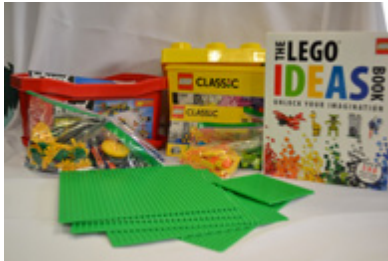
1. Build & Play