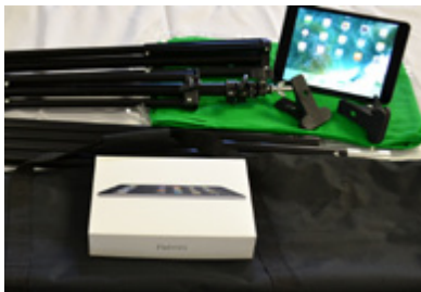
7. Green Screen