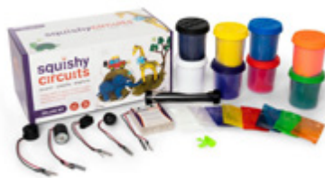
8. Squishy Circuits