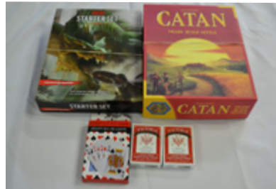
2. Board Games