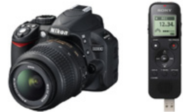
9. Camera & Voice Recorder