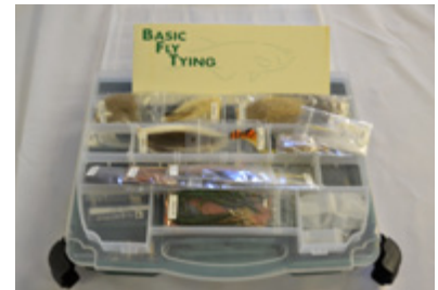
6. Fly Tying