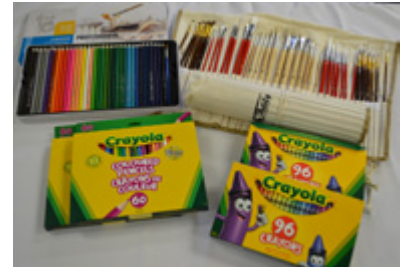
3. Visual Arts