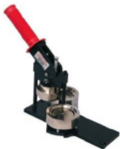
10. Button Maker